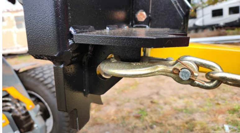
Don't forget to use the chain locks on the grapple hanger to secure your chipper or trailer!