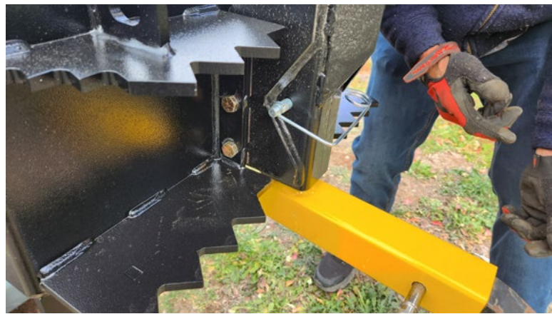
Insert the round tube of the receiver hitch into the square opening underneath the hanger. Use the included snapper pin to secure it through the hanger.