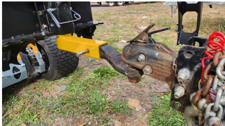
Insert your receiver into the receiver tubing and secure it using a pin. You are now ready to hook up your chipper or trailer!