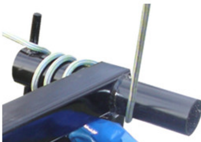
3" Rope Bollard for lifting or directing